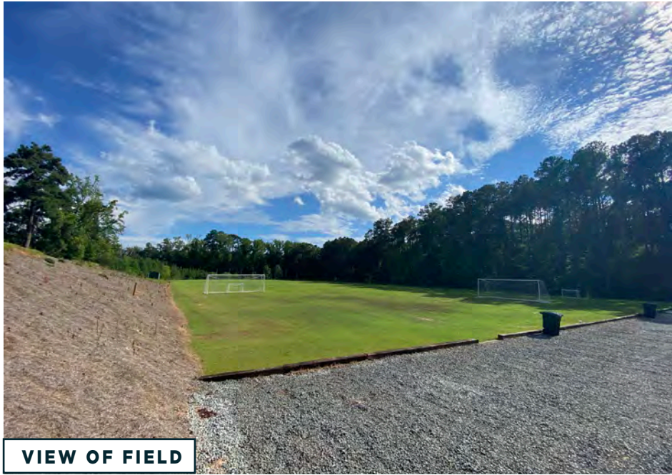
VIEW OF FIELD